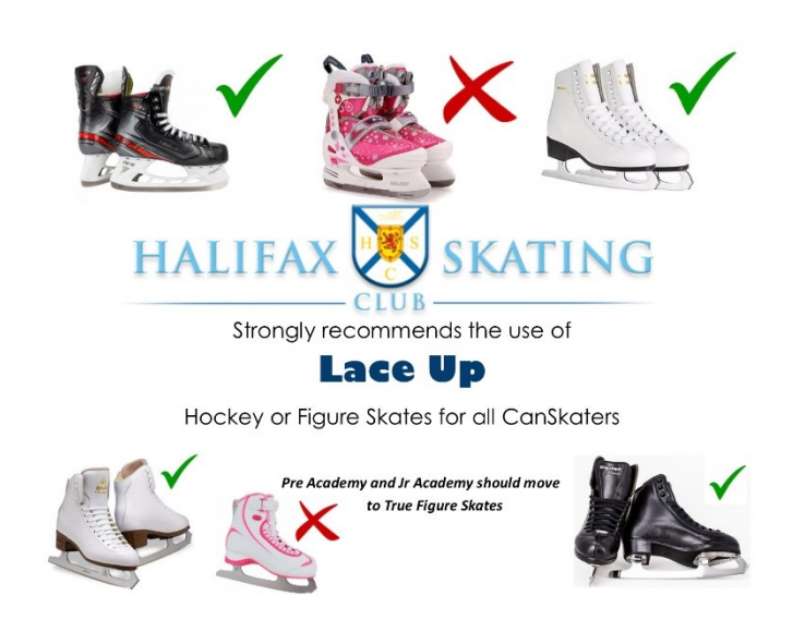
Figure Skate Sharpening

Please make sure the person sharpening your skaters knows to keep the rocker (CURVE) on the blade and to never sharpen the pick off a figure skate. Hockey skates and Figure skates require different sharpening skills/ equipment. Once a toe pick is taken off it the blade can not be fixed